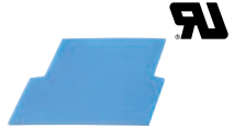
Outlet Box Divider