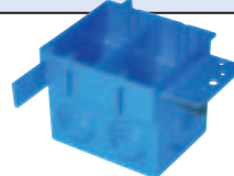
Combination Two Gang/Four Square Box – 38 cu. in.