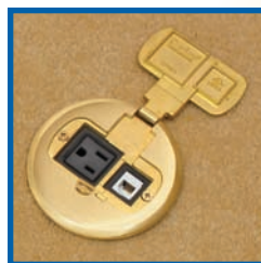
Data Jack not included

Innovative Solutions For Wire and Cable Management.