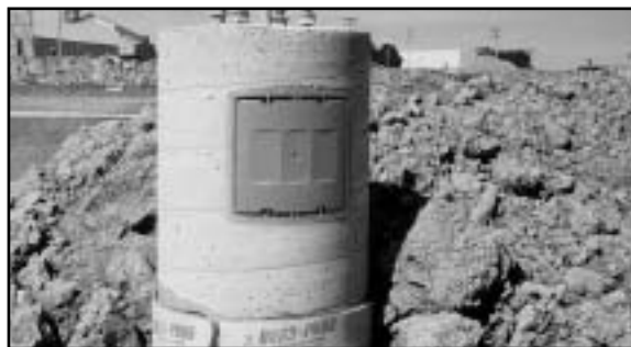
4. After wiring is completed, the lid is replaced to complete the installation.