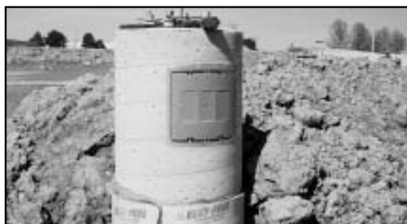
2. Remove form after concrete has been poured and allowed to cure.